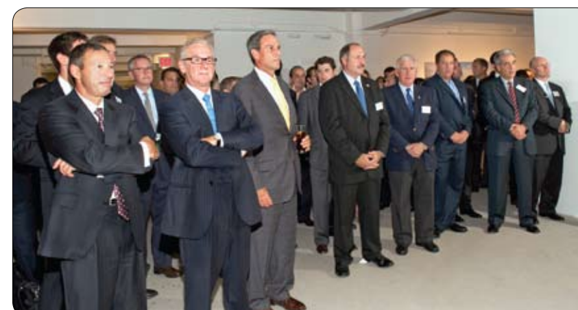
Over 350 top brokers celebrate the Empire State ReBuilding